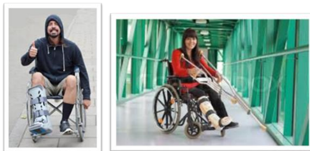
Figure 2 Wheelchair Steps, Colourbox, 2018