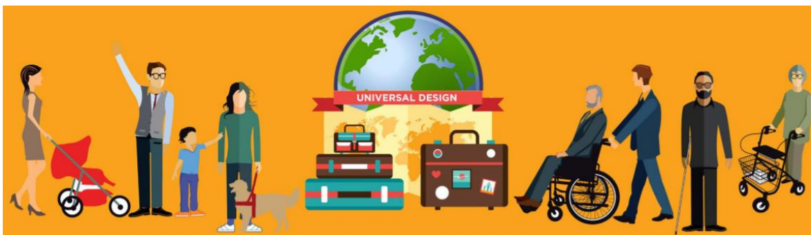
Figure 7 Universal Design, Friendly Design, University Design Council, 2016

Universal Design, Friendly Design is the design and composition of an environment so that it can be accessed, understood and used all people regardless of their, size, age, disability or ability.