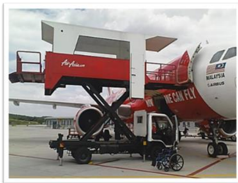
Figure 5 Ambu-lift or Hi lift ,Peter Tan, 2017

Ambulift or Hi lift is a car of the airline used to elevate the wheelchair and passenger together to the aircraft door when the aircraft is parked outside of the passenger terminal building. It is used to transfer passengers.