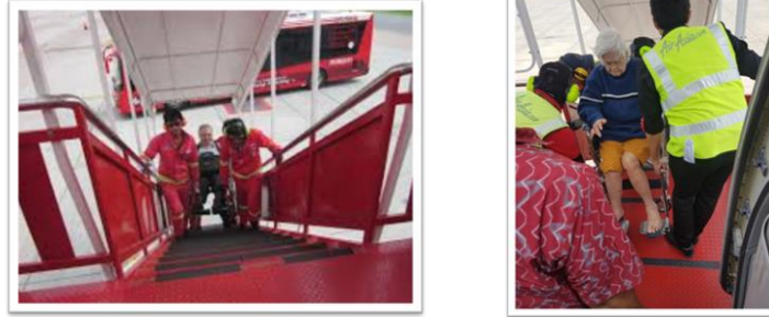
Figure 9 https://support.airasia.com/s/article/How-will-my-wheelchair-mobility-device-be-transported?language=th

Gordon and Langmaid (2000) explained that the advantages of in-depth interviews are able to collect information both broadly and deeply. The questions that can be changed and be flexible if they want passenger to understand better or be able to create positive logical interaction with passengers.