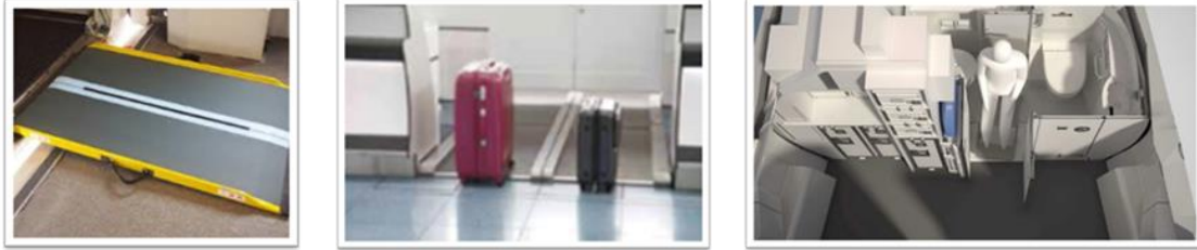
Figure 10: JAL Priority Guest Support, 2015. Level Luggage Check, 2018, Space Flex Lavatory A320, 2015

2) Three experienced passengers who use wheelchair service from Thai AirAsia which have different age were asked about the need to request a wheelchair service and experience traveling with a wheelchair with Thai AirAsia. They provided suggestion to airlines to improve their service to suit passengers. They express their opinion that they feel that wheelchair passengers felt that they are not treated equally with other passengers. It is shameful that they could not help themselves during the journey and there is insufficiency of equipment. Airlines should have a public relations statement explaining useful information and procedures for requesting passenger services through various media.