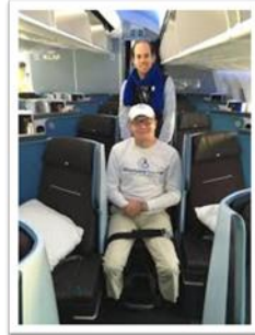
Figure 3 Wheelchair Comp, Whizz-kidz, 2018

4. Wheelchair On-Board (WCOB) is intended for carrying passenger who requires the use of wheelchair to/from cabin seat or during toilet visit while on board.