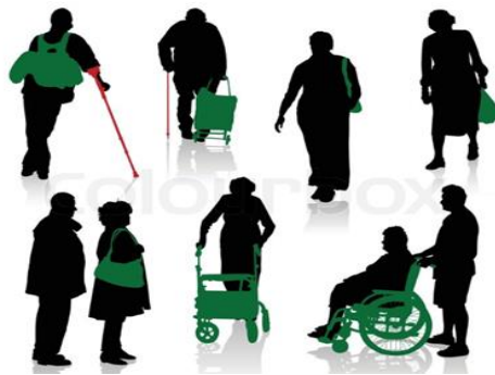
Figure 6 Disabled Passengers, University of Texas at Austin, 2016

Universal Design, Friendly Design is the design and composition of an environment so that it can be accessed, understood and used all people regardless of their, size, age, disability or ability.